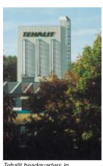
Tehalit headquarters in Heltersberg - Germany